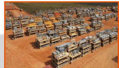
Oil and Gas Platforms